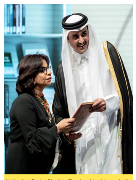
H.H. the Emir Sheikh Tamim bin Hamad Al-Thani receiving the one-millionth book of Qatar National Library at the grand opening ceremony of the library.

Over the following weeks, QNL hosted a series of public lectures and exhibitions, including the inaugural Heritage Library exhibition. (More information on https://www.qnl.qa/en).