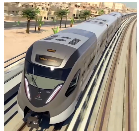
Qatar's train network will provide an agile connection between stadiums where the World Cup 2022 will be played.

With a futuristic design that looks like a spacecraft, the use of the subway will decrease the environmental impact produced by cars in Qatar.