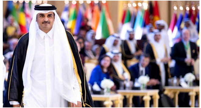
His Highness attended the opening of IPU Assembly last April.

The theme of the general debate was "Parliaments as platforms to enhance education for peace, security and the rule of law", considering the importance of education and its effective role in achieving these goals. Addressing the gathering, H. H. high-lighted: Qatar has paid special attention to international cooperation in the field of education and provided support to some developing countries in various regions of the world, as well as international organisations operating in this field. Our country has also launched numerous initiatives in the field of supporting and promoting education in collaboration with