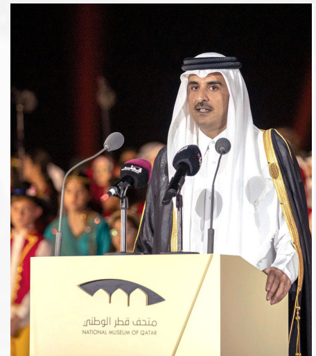
H.H. the Amir at the opening ceremony of NMoQ in Doha.

The event was attended by Personal Representative of the Amir H.H. Sheikh Jassim bin Hamad Al-Thani, and Prime Minister and Minister of Interior H.E. Sheikh Abdullah bin Nasser bin Khalifa Al-Thani. A number of sheikhs, ministers and heads of diplomatic missions, prominent figures from politics, culture, media, and celebrities interested in heritage sites from around the world came to the opening as well. More information on: https://nmoq.org.qa/ .