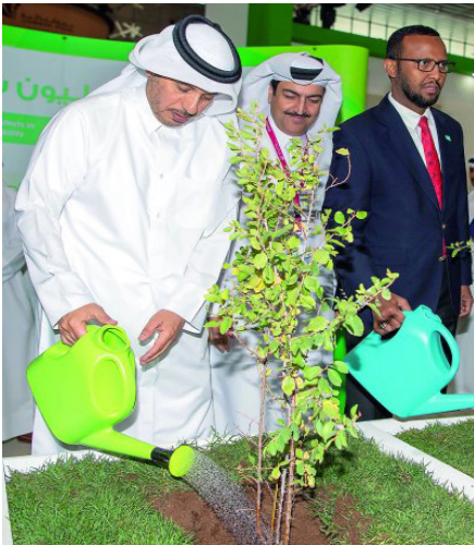
PM and Minister of Interior H.E. Sheikh Abdullah Al-Thani at the inauguration of AgriteQ 2019 in Doha.