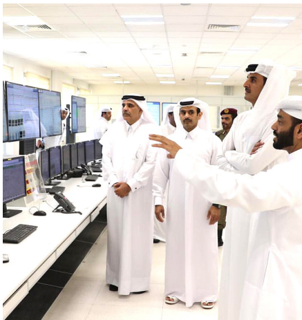
After the inauguration, the Amir was given a tour around the facility.