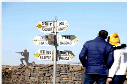
Last March, US President recognized Israel’s claim to sovereignty over the Golan Heights.

Qatar expressed its rejection of the US recognition of Israel’s sovereignty over the Golan Heights.