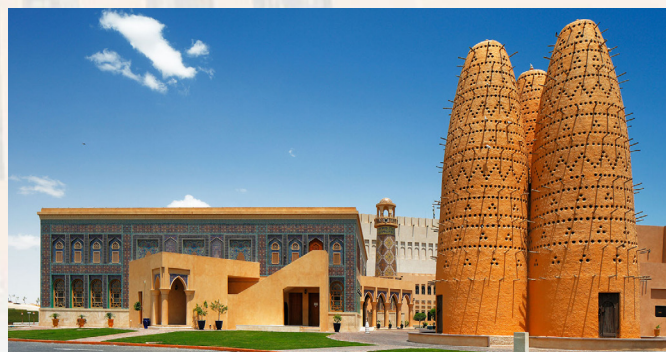
Katara Cultural Village.

Last but not least, the National Museum of Qatar (NMoQ). Designed as a vibrant and immersive space, it actively shows the nation's heritage and culture, and Qatari people's extensive ties with other nations and people around the world. NMoQ is today one of the most recognisable landmarks of Qatar, and serves as a monument to its historical way of life.