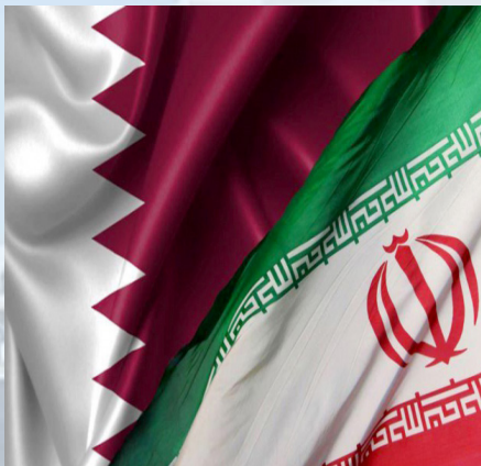
President Rouhani said Qatar's stances are based "on the policy of good neighbourliness and aimed at reducing tensions".

Athletics Federations (IAAF). These Championships were started in 1976. In 2014, Qatar applied for the 2019 bid and became the hosting country. Doha is the first city in the Middle East to host this event in the history of Athletics, edging out Eugene (USA) and Barcelona (Spain).