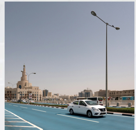
The 200-metre stretch of blue road near Souq Waqif paved with the so-called 'cool pavement'.

The project will last for 18 months and based on the pilot, it will determine its wider applicability. A similar experiment has been implemented in Los Angeles (USA), in an effort to cool the city as it is hit by climate change.