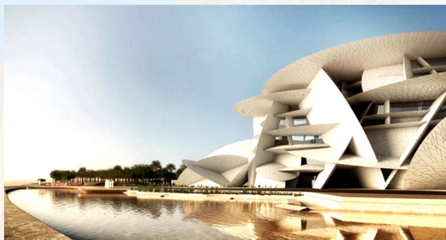
National Museum of Qatar.

Within the last decade, Qatar has become an important hub of art and culture not only within the region, but is also being recognised for promoting the art of Islamic civilisations through the ages and Qatari traditions and rich heritage. Its wide range of museums are proof that Qatar's intention of becoming the world's capital for art and culture is slowly becoming a reality.