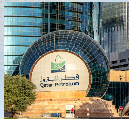
The deal was signed at the White House in the presence of US president and Qatar's emir, H.H Sheikh Tamim bin Hamad Al-Thani.

Qatar is the world's largest exporter of liquefied natural gas (LNG), and it has been broadening its energy interests since Saudi Arabia, the United Arab Emirates, Bahrain and Egypt severed ties with it in 2017.